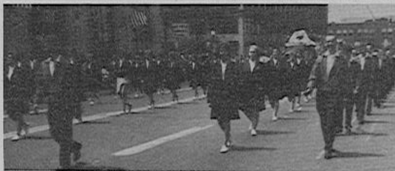
DeMolay & Triangle march in Memorial Day Parade: 35 DeMolay boys and 52 Triangle girls turned out to march with the James A. Hard Post of the Masonic War Veterans in the Memorial Day Parade in Rochester on May 30, 1963. Did you see them? We are proud of all of them.