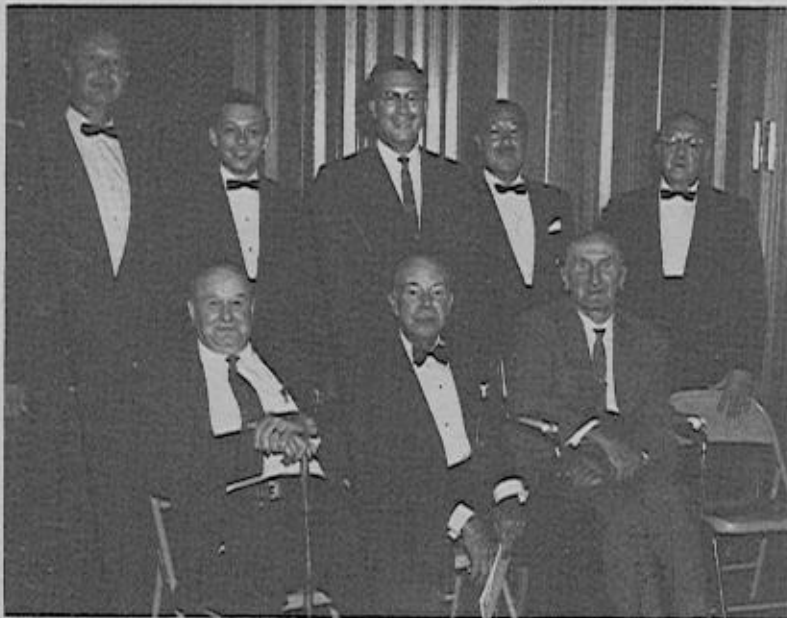
Henrietta Lodge No. 526 100th Anniversary celebration at Vince's 50 Acres on June 8, 1963.