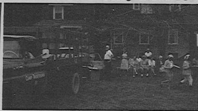
Picnic at Salvation Army Camp.

tribute to the dead. When the legend of Hiram Abif appeared in our ritual (about 1730), and our brethren wanted something to symbolize immortality, it was quite natural for them to choose a sprig from the sacred tree of the days of Solomon, the acacia.