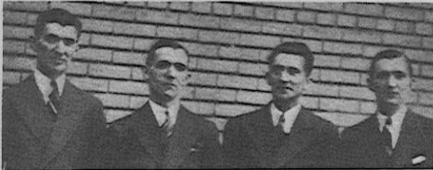
This picture appeared in the March 1939 issue of the Masonic Outlook magazine

We hope they will be with us in 1988 to receive their Fifty Year Awards.